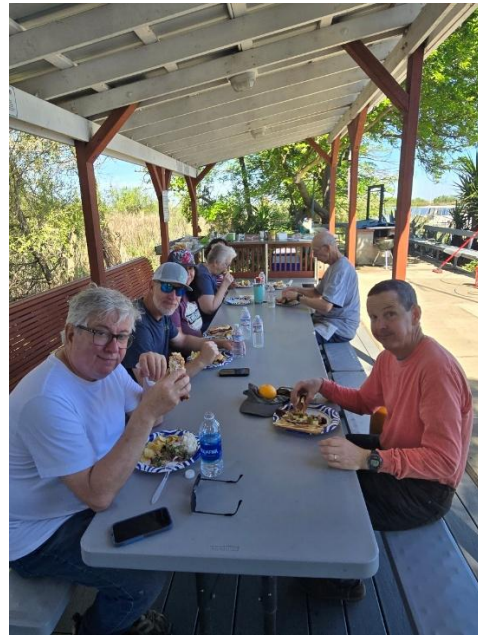
Lunch Break (Well Deserved)

A BIG THANK YOU TO ALL THAT PARTICIPATED IN THE ISLAND CLEAN-UP